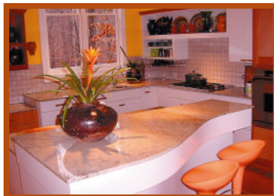
Kashmir Granite Piano Island

Often, without the benefit of a visit to our shop, it is hard to understand the value we can add to your jobs that will distinguish your work and