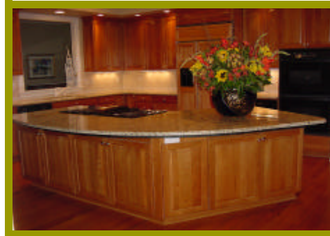
Cantilevered Giallo Ornamental Granite

benefit from the use of a factory seam, we make a jobsite visit and determine if access and clearances for an oversized piece are adequate.